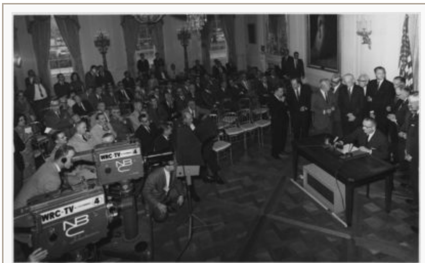
President Lyndon B. Johnson signs "Gulf of Tonkin" Resolution

When Johnson took the oath of office in the wake of Kennedy's shocking death, he brought his own concerns about American credibility. Johnson ascribed to the domino theory, and he believed that South Vietnam was the victim of communist aggression from and directed by North Vietnam. If the U.S. failed to step in and help South Vietnam, it would send a message to the rest of Southeast Asia and the world that the U.S. was not truly committed to containing communism. The problem for Johnson was that deep down he didn't necessarily want to commit U.S. troops to the fight. He believed the South Vietnamese should fight for themselves